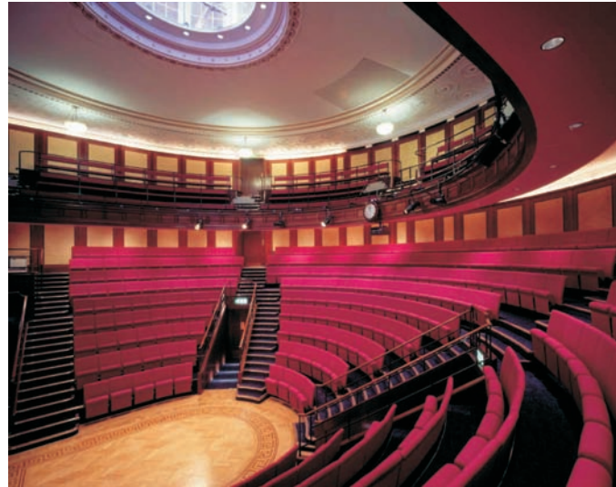
The Faraday Lecture Theatre at the Royal Institution of Great Britain

The newly refurbished Faraday Lecture Theatre seats up to 300 including the balcony, but will comfortably seat 200 in the lower tiered seats with an excellent view of the speaker, desk and the projected presentations.